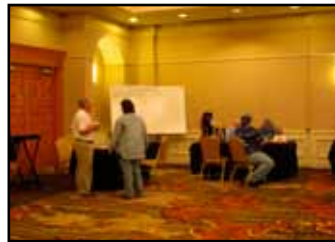
Door Prize Board