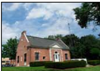
At The ARRL