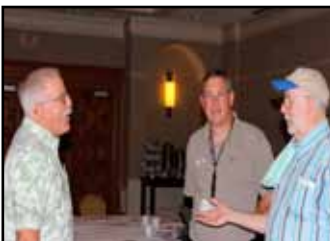
KM5EH - K1PU - WA1TRY