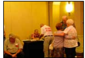
Busy Chapter Tables