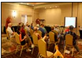
The Digital Modes Presentation