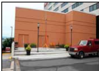
Antenna by Castle Craig Chapter