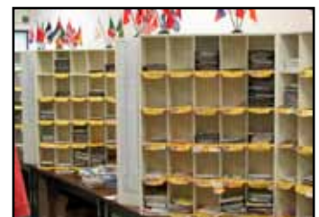
The ARRL QSL Bureau