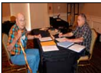
KB7ARN - N6OPR