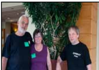
DL5HAN - DL5HCN - DH8BAT