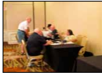
Busy Chapter Tables