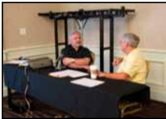
Eyeball QSO At The Rig