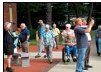
Arrival At ARRL