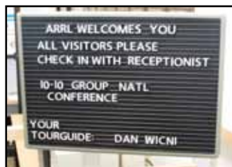
Welcome 10-10 International