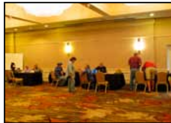
The Neanderthal & Waterkant Chapters