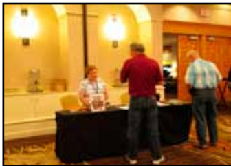
The ARRL Table