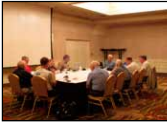
BOD Hard At Work