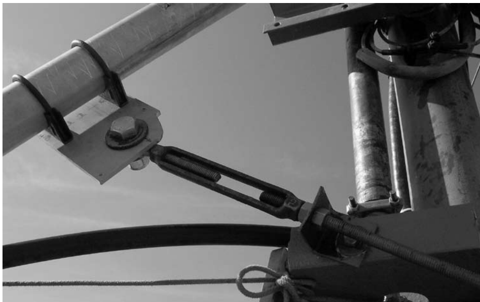
View Showing The Boom Bracket And A Simple Reference Bracket

must be custom drilled and fitted with the corresponding U bolts/exhaust pipe clamps; so they can't be pre-drilled.