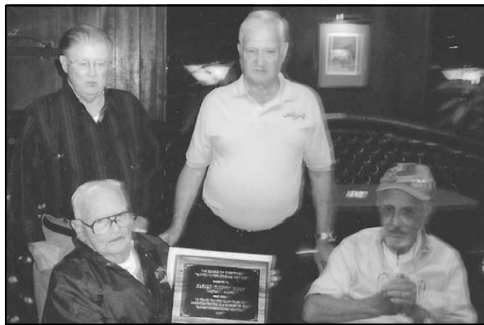
N6OPR, W6JNU, WA6TQC, WB6JVP